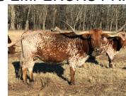
SS EMPERORS PRINCESS