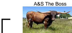
A&S The Boss