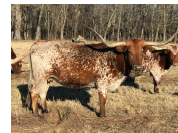
SS EMPERORS PRINCESS